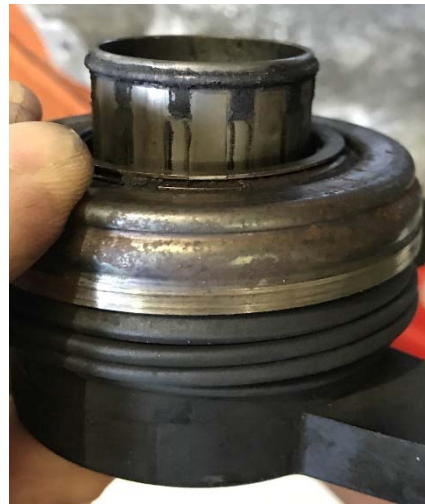
Clutch dust built up along the 12 axial slots.

It was glaringly obvious that 12 axial grooves on the inside diameter of the plastic piston were allowing clutch dust to migrate from the front of the cylinder to the seal at the back end of the piston and ultimately across the seal resulting in the pattern failure seen on the sample cylinders. This design of 12 axial grooves in the sliding surface correctly decreased the sliding friction as intended but myopically failed to mitigate the propagation of clutch dust into the seal itself!