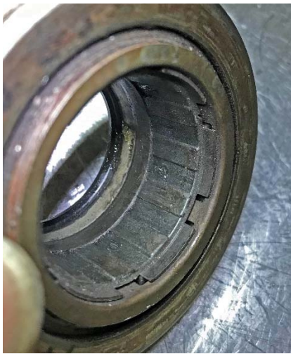
Axial slots directly exposing the seal to clutch dust.

Consistent among all of the failed samples was a large ingestion of clutch dust into the cylinder's inner sealing sleeve and ultimately passing through the hydraulic seal itself. In most cases the seal had not been damaged, but had been contaminated by large amounts of clutch dust which would eventually lift the seal off of the sleeve allowing fluid to escape to the exterior of the cylinder. On many of the failed cylinders this condition was expedited by distortion of the plastic piston / seal support used as a substitute for a more appropriate metal piston / seal support as a cost saving measure.