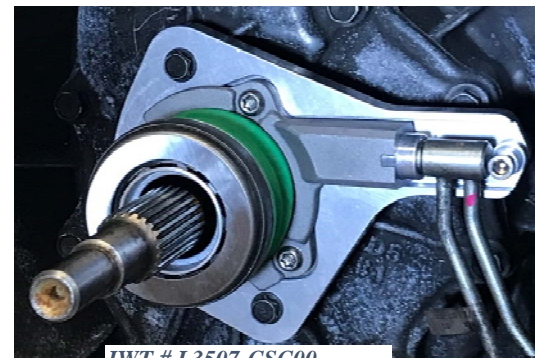
JWT # L3507-CSC00

JWT has designed a new direct fit C.S.C. that addresses both issues with the O.E. cylinder by incorporating an all-aluminum piston / seal support featuring 2 full radial PTFE sleeve wipers dramatically reducing friction and clutch dust migration to the seal. The JWT C.S.C. is a direct fit replacement for the original C.S.C. using all of the original factory hydraulic lines and fittings with no modifications or additional hoses, simply install the same as a stock C.S.C.